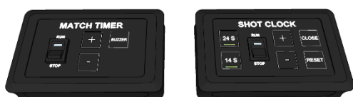
Handy Match timer