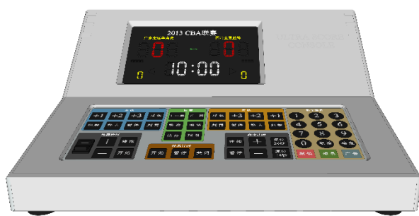
Ultra Score Console