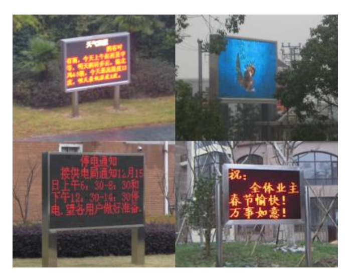
weather report automatically.